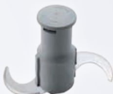
Microtoothed blade rotor