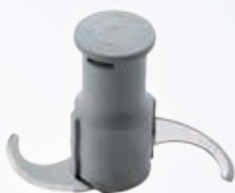
Smooth blade rotor

Choose the perfect cutting blade for your preparation.