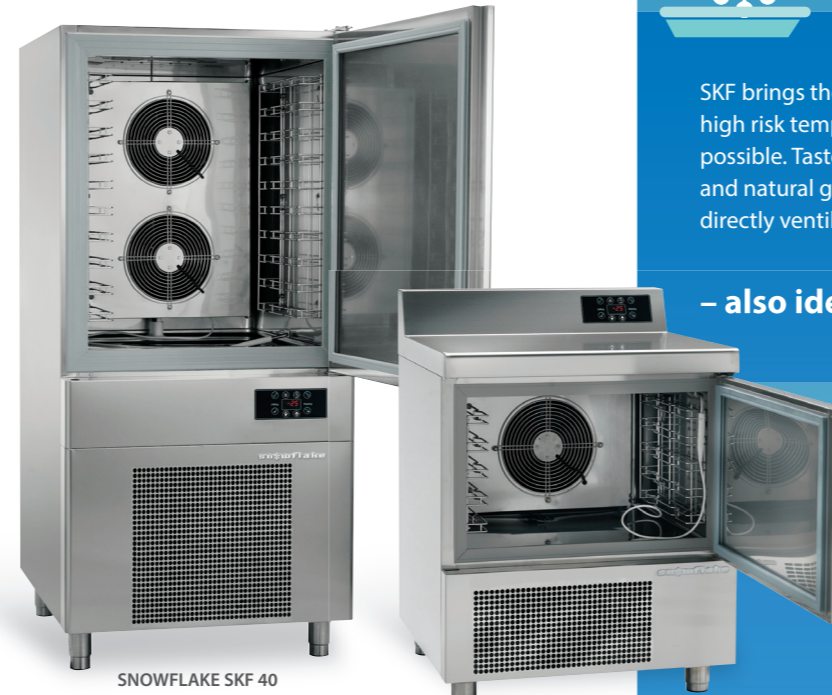
SNOWFLAKE SKF 40