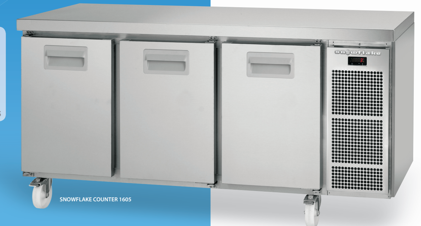
SNOWFLAKE COUNTER 1605