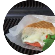
Contact grill and highspeed oven heating

From the display counter, to the contact grill or oven, to the customer ready to eat, this is a hygienic, cost-effective product with easy handling.