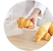
Take-away deli and snacks