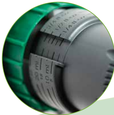
Green dosing ring, dosing marks