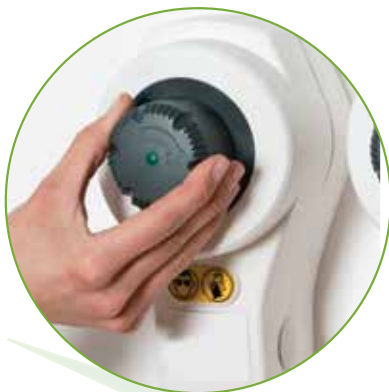
Twist and push operation

Ecoshot cleaning station, including sink, spray bottle and bucket versions