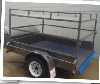
QUATTRO Stage Trailer with Custom Rear Roll Bar