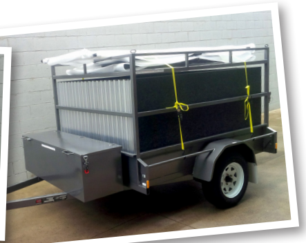
Fully Laden with 6x6mtr Stage and Accessories

High Spirits Harmony is a talented a cappella harmony choir comprising of only women based in SA. Again, the specifications for a performance stage required a new design approach to our successful tiered choir stand, the MELBA Fold & Roll Choir Riser. The original MELBA has 4 performance levels, a large performance space not required for the choir members – smaller is best. They also needed a tiered system which although portable has to curve plus have