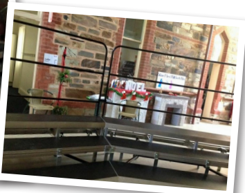
Modular hand rails