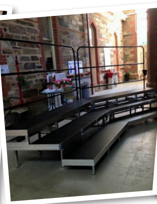
Curved 3 Tier MELBA