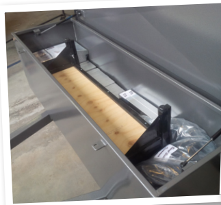
Custom Tool Box for Valance Curtain and Small attachments

All QUATTRO stage componentry is compactly housed in the tray and tool box sections – a simple effective solution which will work with the needs of Rural Health Tasmania for years to come.