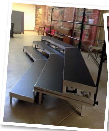
Bespoke MELBA Fold & Roll

Select Concepts congratulates both customers on choosing an Australian designed and manufactured Stage System and wish you every success performing on the road.