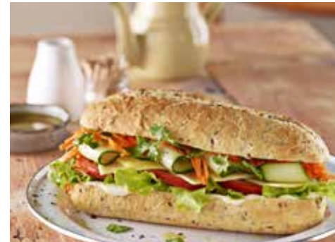
SPEEDIBAKE LARGE SANDWICH SUB MULTIGRAIN