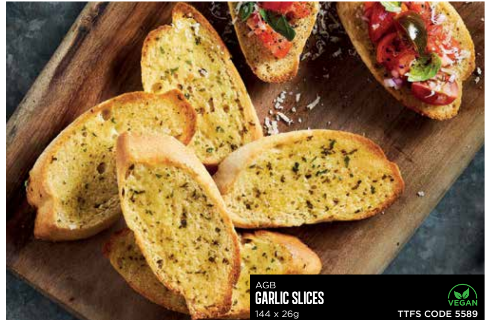
AGB GARLIC SLICES 144 x 26g