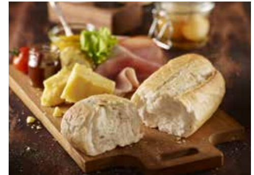
SPEEDIBAKE LARGE SANDWICH SUB WHITE - PAR BAKE