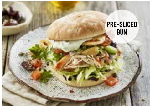
TIP TOP DAMPER BUN 5" 72 x 75g