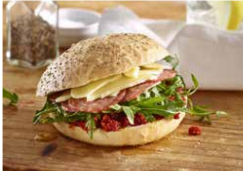
SPEEDIBAKE FOCACCIA LUNCH ROLL 50 x 120g