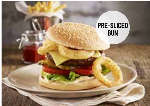
TIP TOP HAMBURGER BUN 5" 72 x 87g