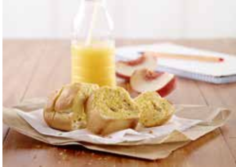
AGB GARLIC BREAD FOR ONE 4.5" 48 x 85g