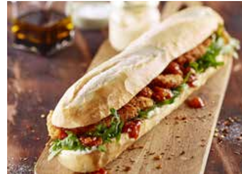
SPEEDIBAKE HALF BAGUETTE WHITE - PAR BAKE