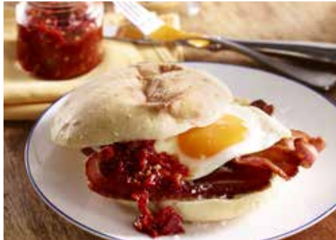
SPEEDIBAKE SOFT TURKISH ROUND LUNCH ROLL