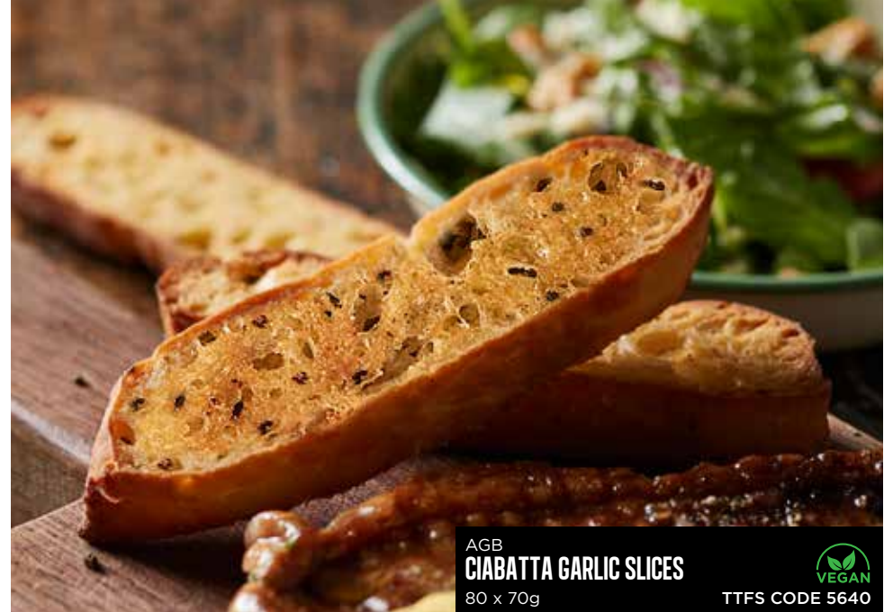
AGB CIABATTA GARLIC SLICES 80 x 70g