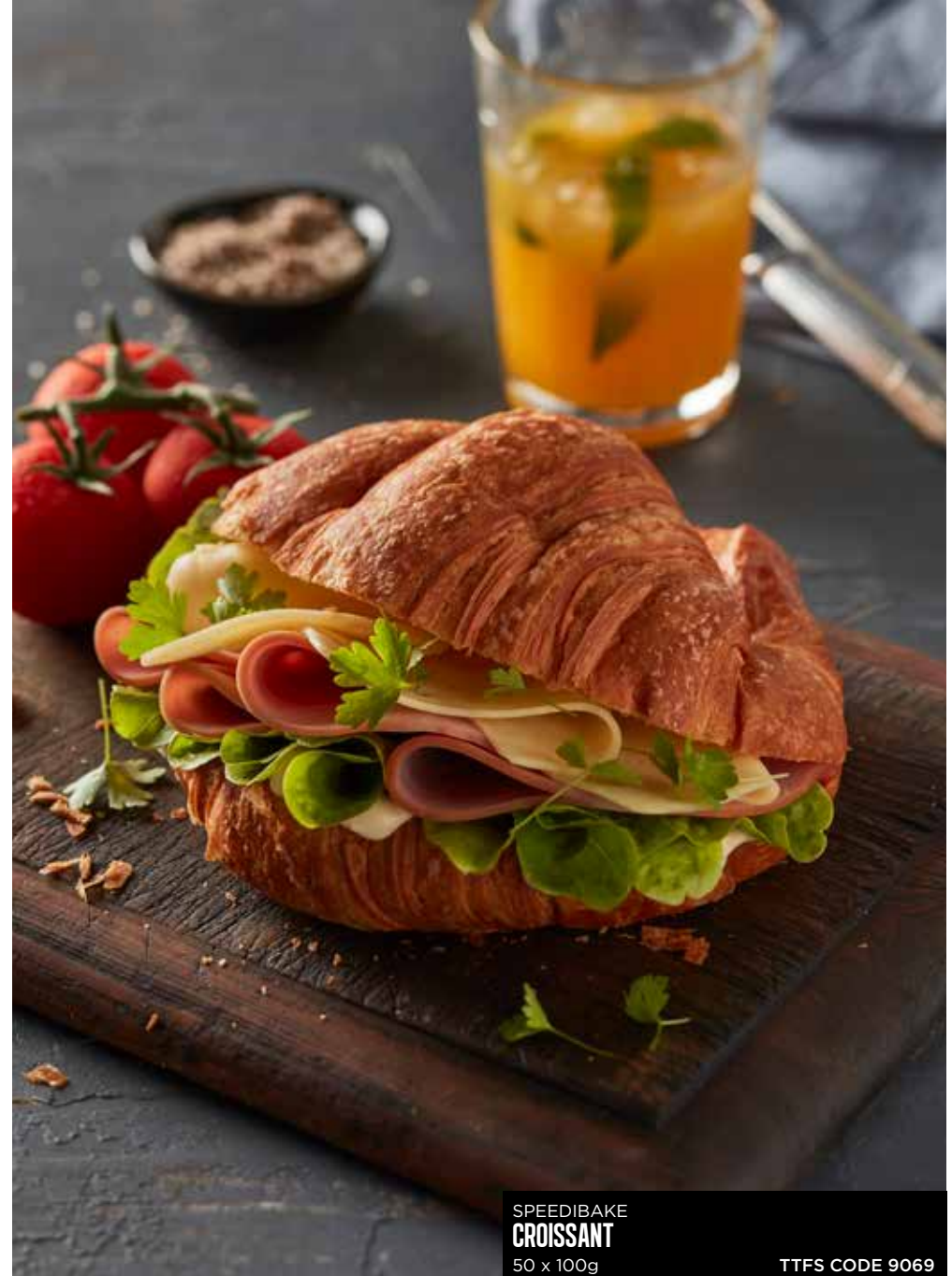
SPEEDIBAKE CROISSANT 50 x 100g