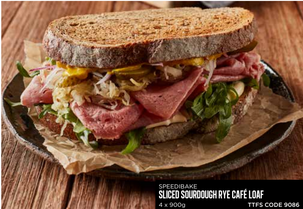
SPEEDIBAKE SLICED SOURDOUGH RYE CAFÉ LOAF 4 x 900g TTFS CODE 9086