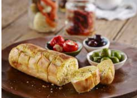
AGB GARLIC BREAD CATERING 9" SINGLE 40 x 170g