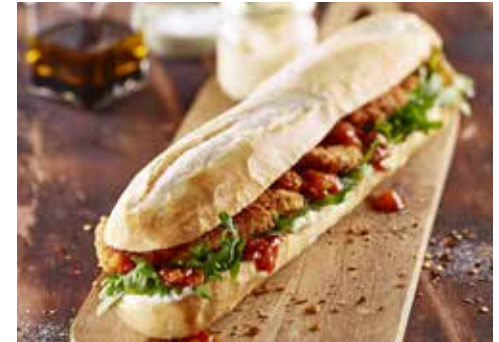
SPEEDIBAKE HALF BAGUETTE WHITE