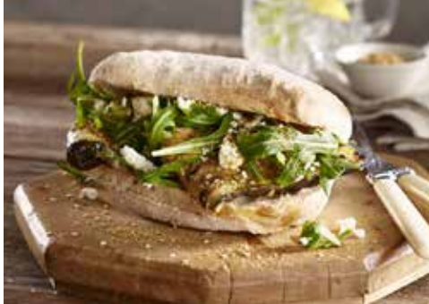
SPEEDIBAKE RUSTIC CIABATTA LUNCH ROLL 50 x 190g

✓ 10 YEAR CULTURE ✓ 24 HOUR BULK FERMENTED ✓ HAND-MOULDED & SCORED