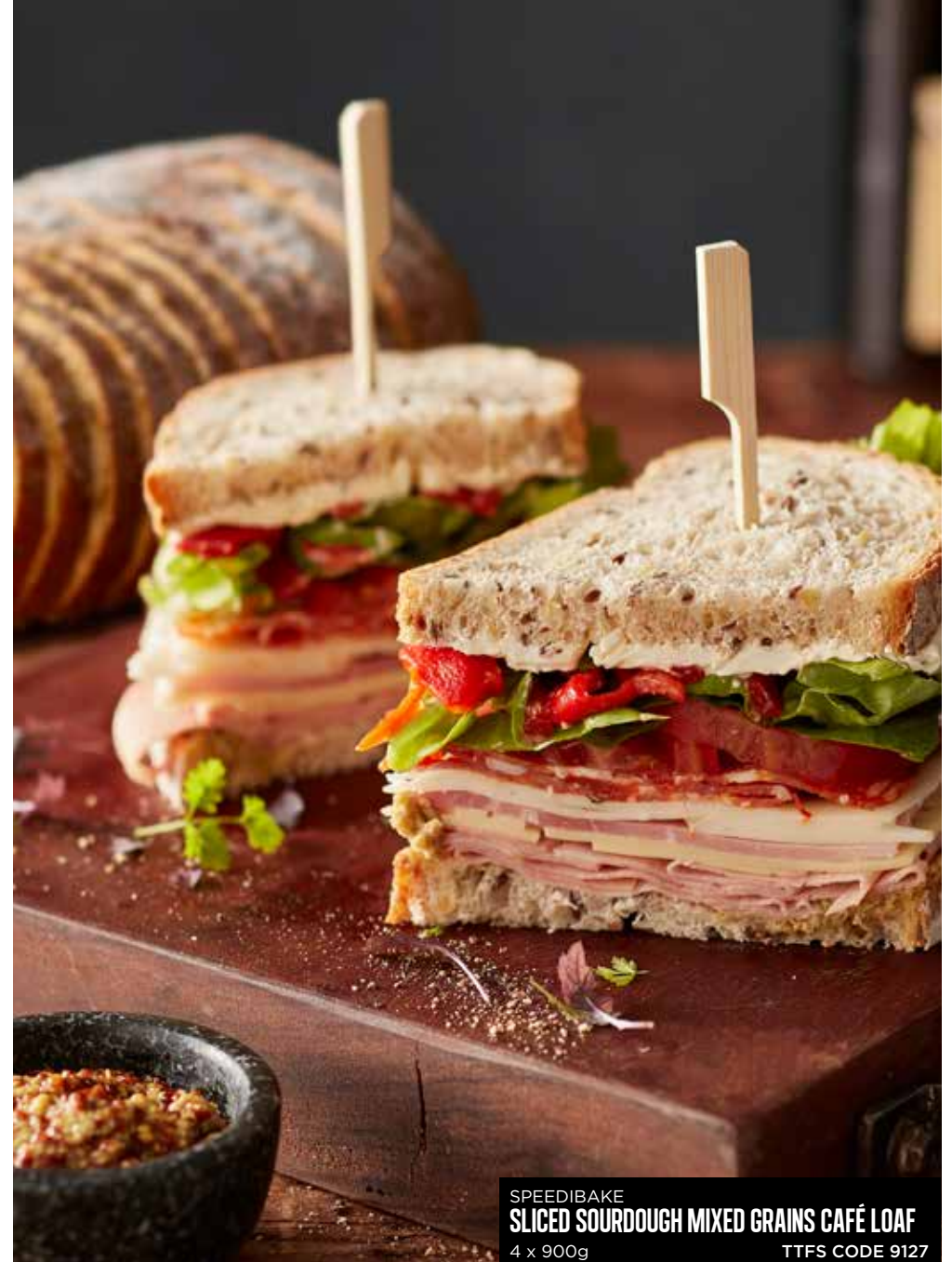
SPEEDIBAKE SLICED SOURDOUGH MIXED GRAINS CAFÉ LOAF 4 x 900g