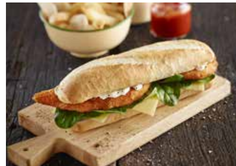
SPEEDIBAKE LARGE SANDWICH SUB WHITE