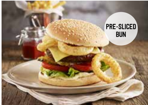
TIP TOP HAMBURGER BUN 4" 60 x 70g